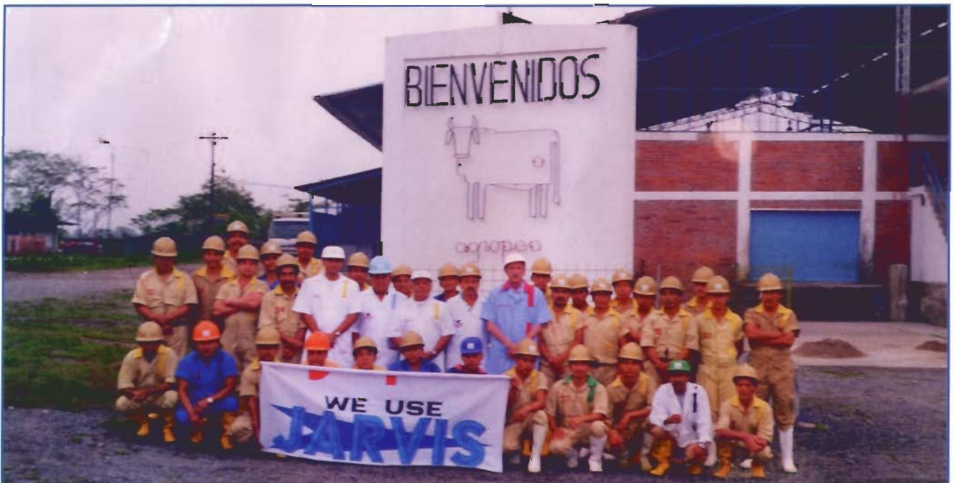
Picture taken at Agropesa's Bienvenidos meat processing plant. The sign says it all.